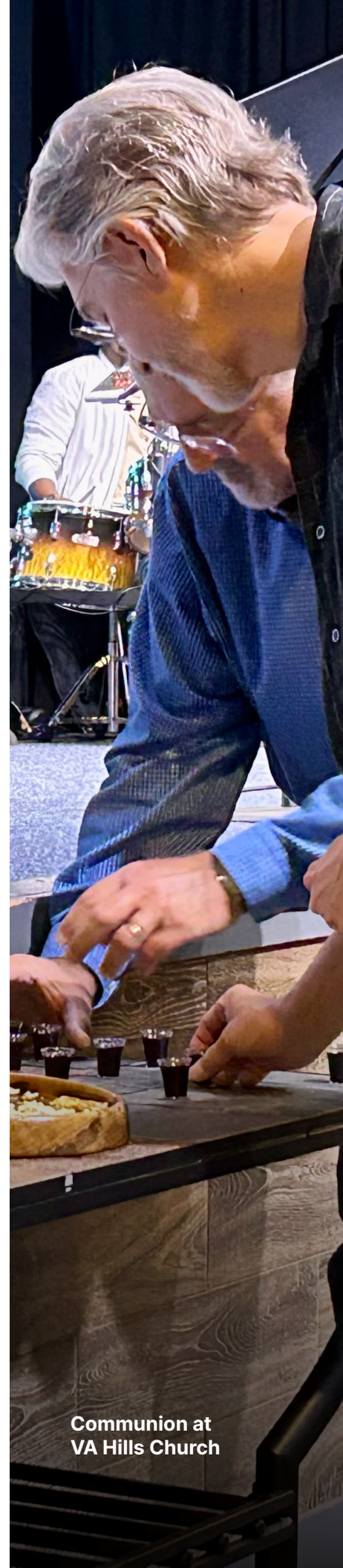
Communion at VA Hills Church